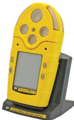
Optional rechargeable battery and slip-in cradle charger