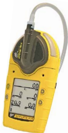
GasAlertMicro 5 with integrally attached pump